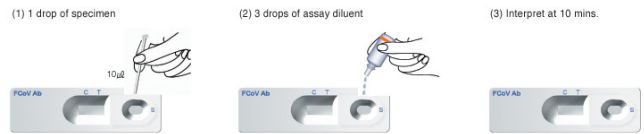
[Figure for test procedures]